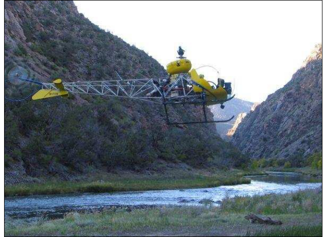
A helicopter-assisted stocking program in the Gunnison Gorge resulted in reproduction and survival of a hybrid rainbow trout that is resistant to whirling disease.

More precisely, Colorado's extensive cross-breeding experiment has produced the first WD-resistant rainbow progeny born in the wild. Trials conducted last fall in the lower Gunnison River and a private pond near the Frying Pan River produced surviving fry genetically linked to hybrid trout stocked two years earlier.