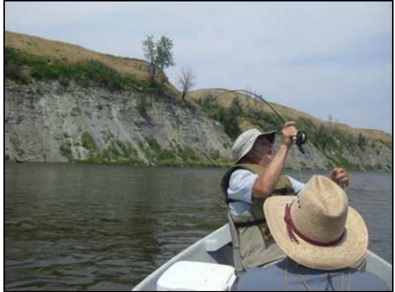
Hmmmm... I'm not even going to ask what was happening HERE! — Ed.