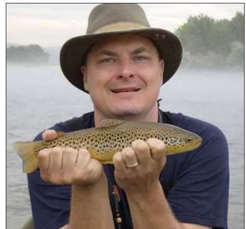
A nice Big Horn Brown.