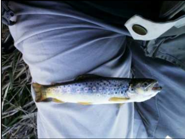
Al Welch with a "trout self-portrait"