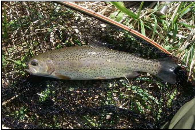
Friday's fish weren't large, but they were hungry.

I think most everybody caught fish during the day.