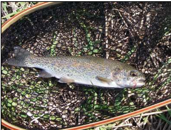
I love using those #20 Midge Larva — aka, the "Blood Worm"